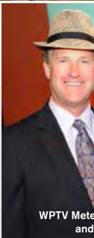
WPTV Meteorologist and