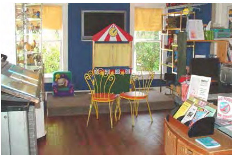
Exhibits at the Boca Raton Children's Museum