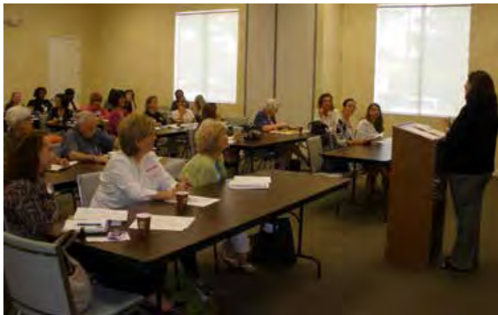
Recent workshop on How to Find, Recruit and Retain Great Volunteers.